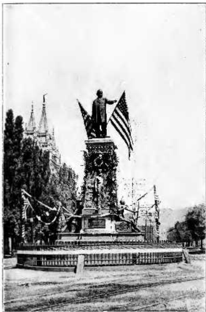
Statue to Brigham Young and the Pioneers