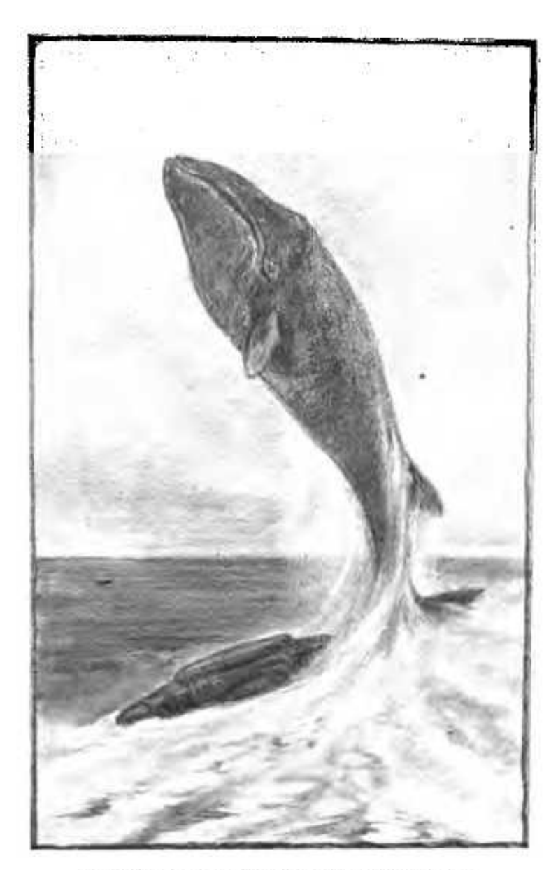
"Captain Sam saw the gigantic creature in the air"