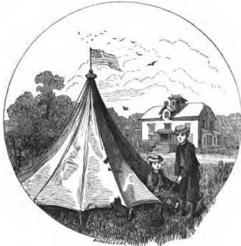
HOUSE ON THE HILL.

U.S. DEPARTMENT OF THE INTERIOR BUREAU OF LAND MANAGEMENT PUBLIC LANDS 985507A ACRES TENThs E. 1/4