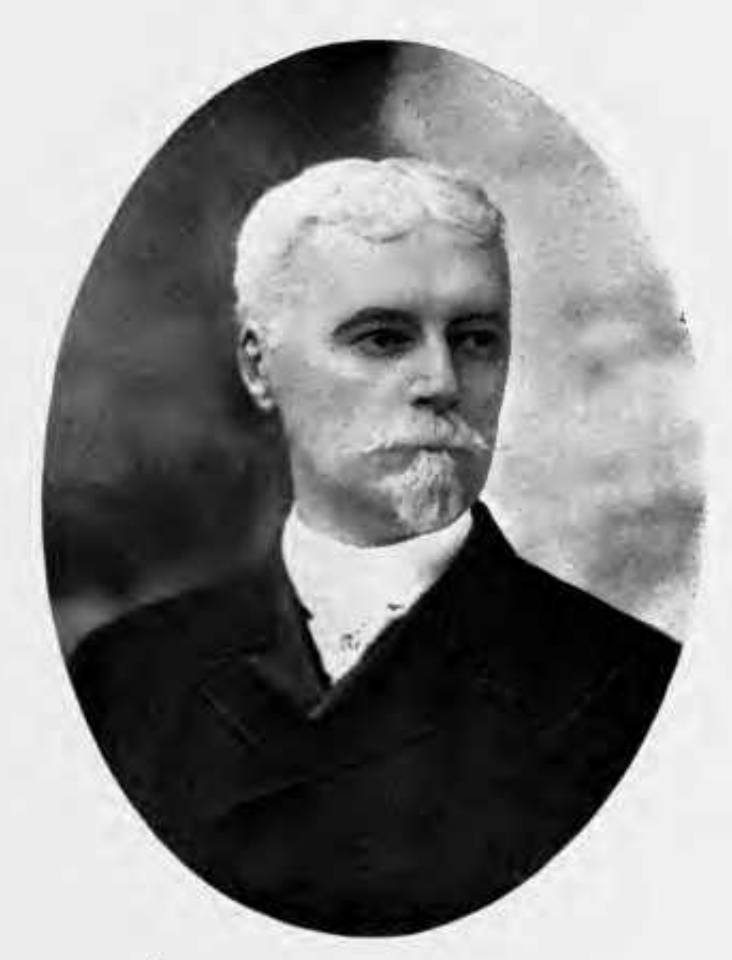
They up of the Some?