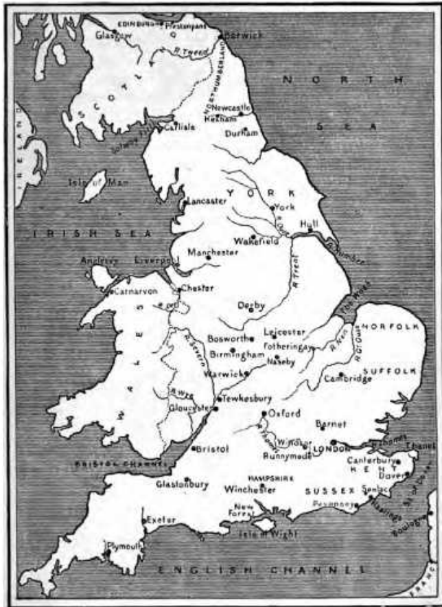
MAP OF ENGLAND, Showing the places mentioned in the Book.