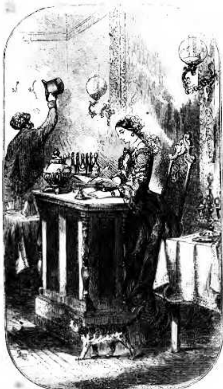
Restaurant (Café) on the Boulevards. Page 223.