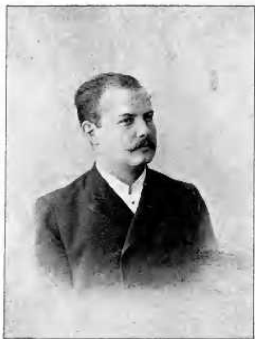
John Henry Mackay.