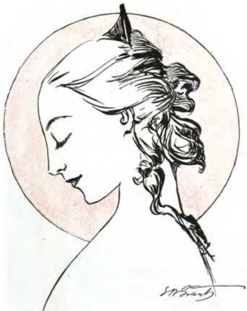
The Eternal Deception