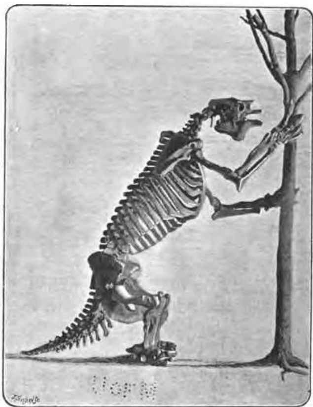
Skeleton of Megatherium Americanum , Cuvier. PLEISTOCENE, BUENOS AYRES, S. AMERICA.