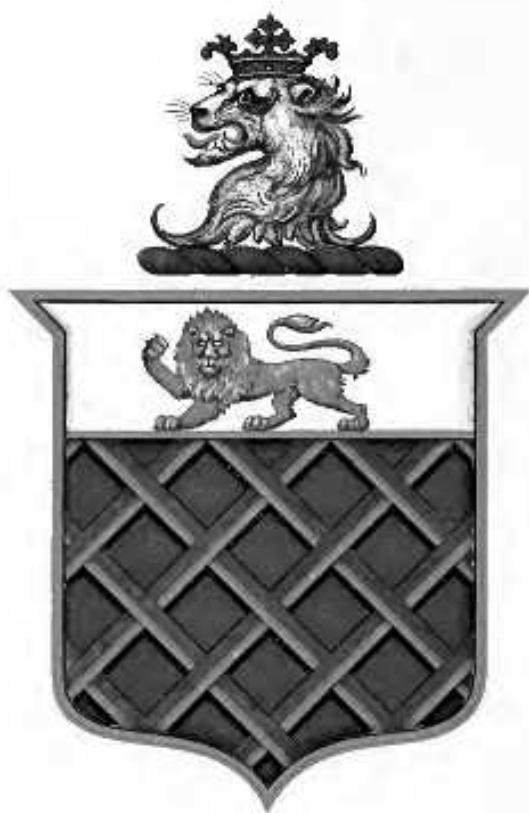
JEFFERAY COAT OF ARMS.