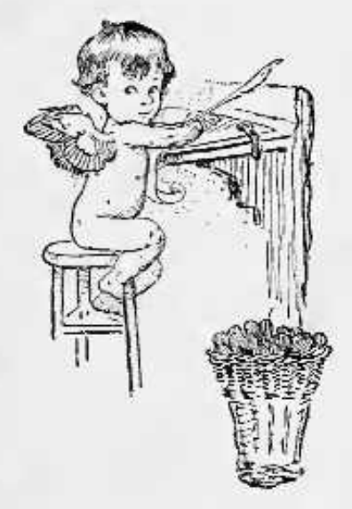
Illustrated by F. Y. Cory