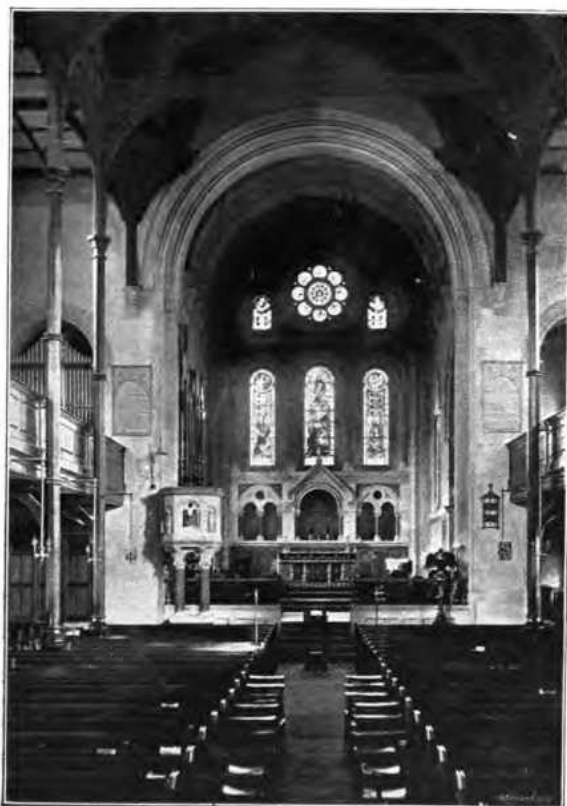
Lewisbam Church, 1892.