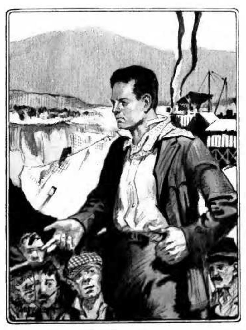
"Creighton believed that every man must have three thingsreligion, a job and a hobby."