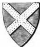
THE ARMS OF THE ABBEY.

INTENDED CHIEFLY FOR THE USE OF VISITORS.