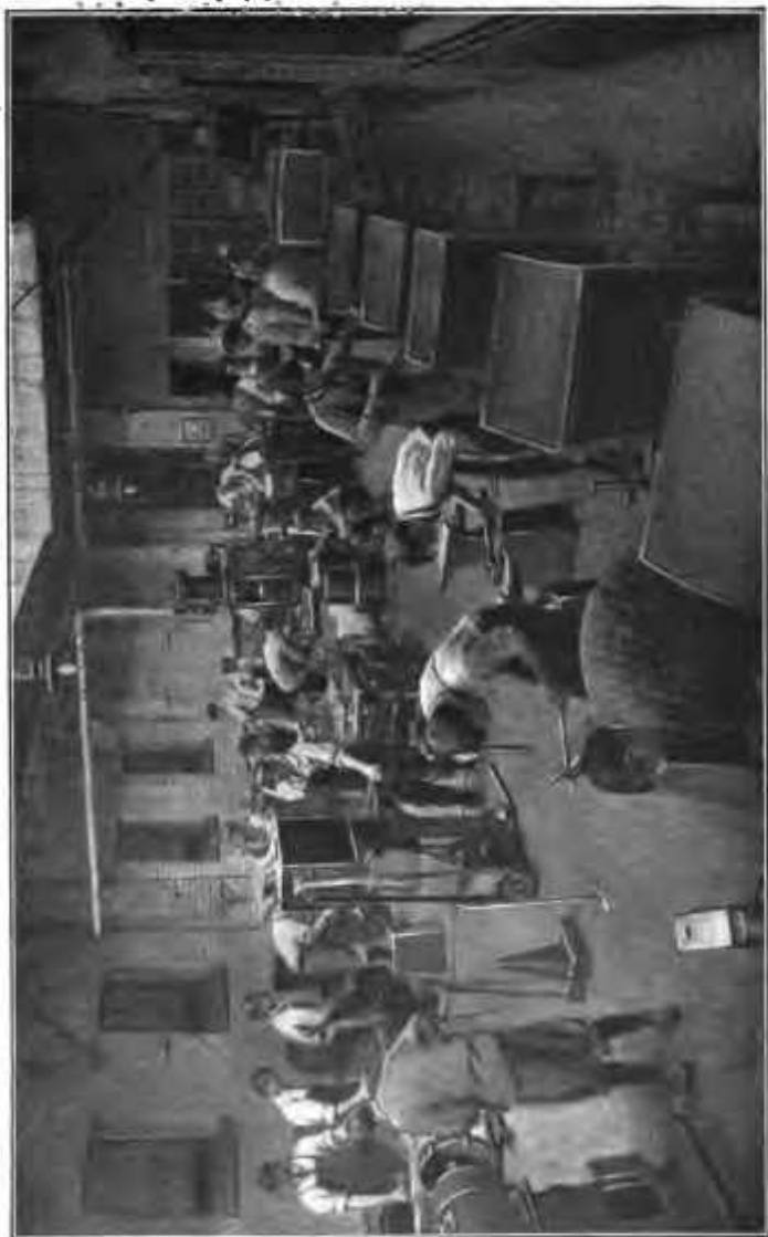
A MANUAL TRAINING FORGE SHOP