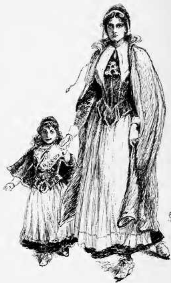
Hester Prynne and Pearl.