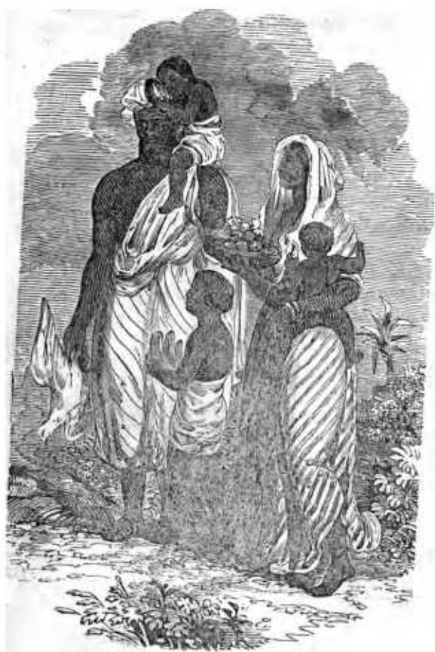
A FAMILY TAKING OFFERINGS TO THEIR GODS. — SEE P. 81.