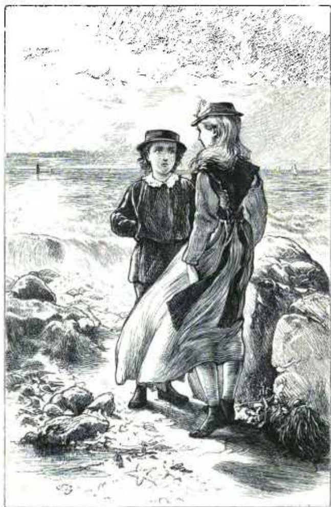
CHILDREN OF THE SUN.