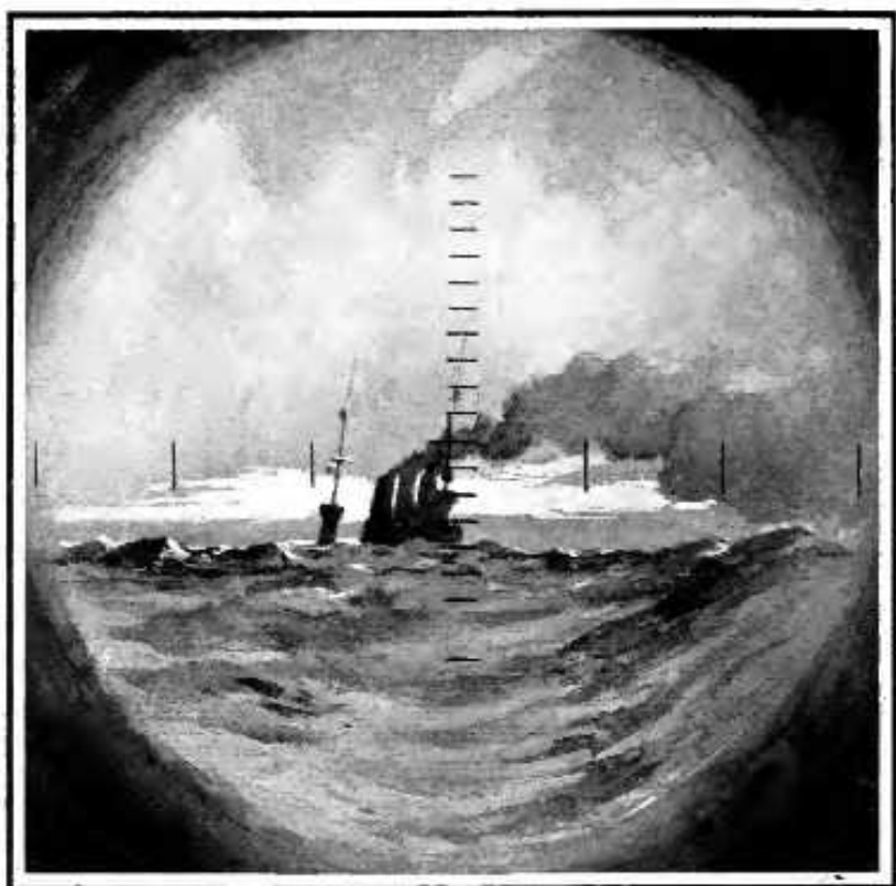
WHAT THE OFFICER IN THE SUBMARINE SEES THROUGH HIS PERISCOPE