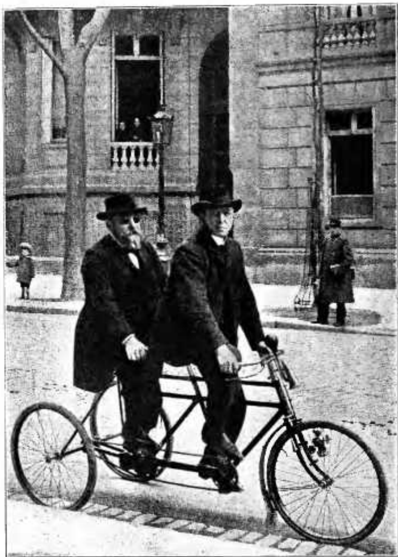
DR. ÉMILE JAVAL ON HIS TANDEM TRICYCLE.