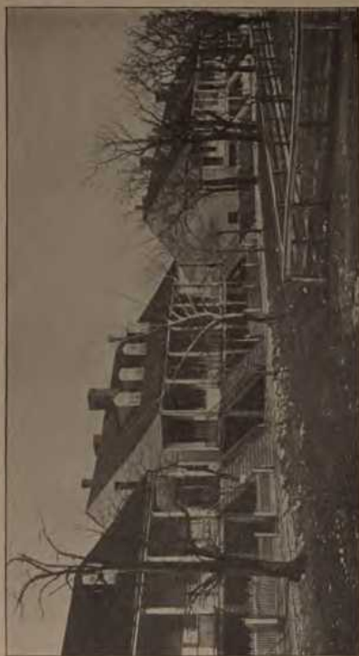
RELIQS OF A PAST ERA.