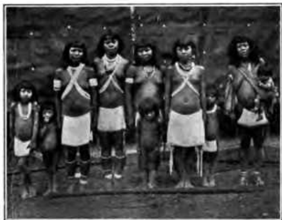
HAMMOCK LAND INDIANS