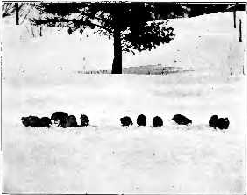
BOB-WHITE AT FEEDING-STATION