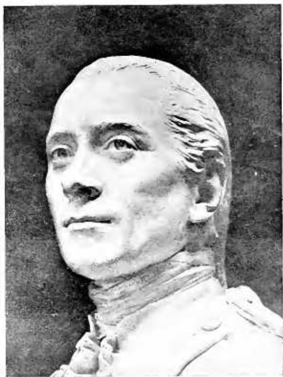
Admiral JOHN PAUL JONES