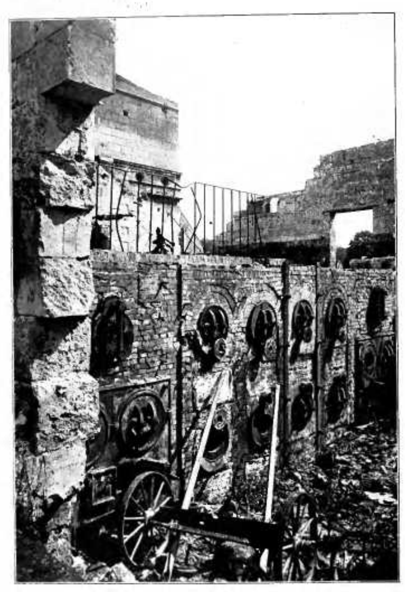
German thefts of factory equipment in northern France. Beiler-room in a factory at Chiry-Ouescamp, Oise.