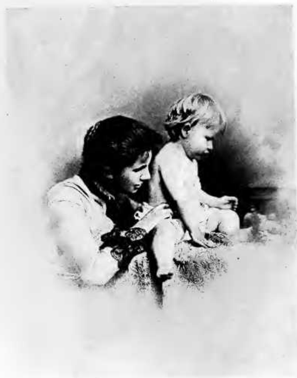
Mother & Child.