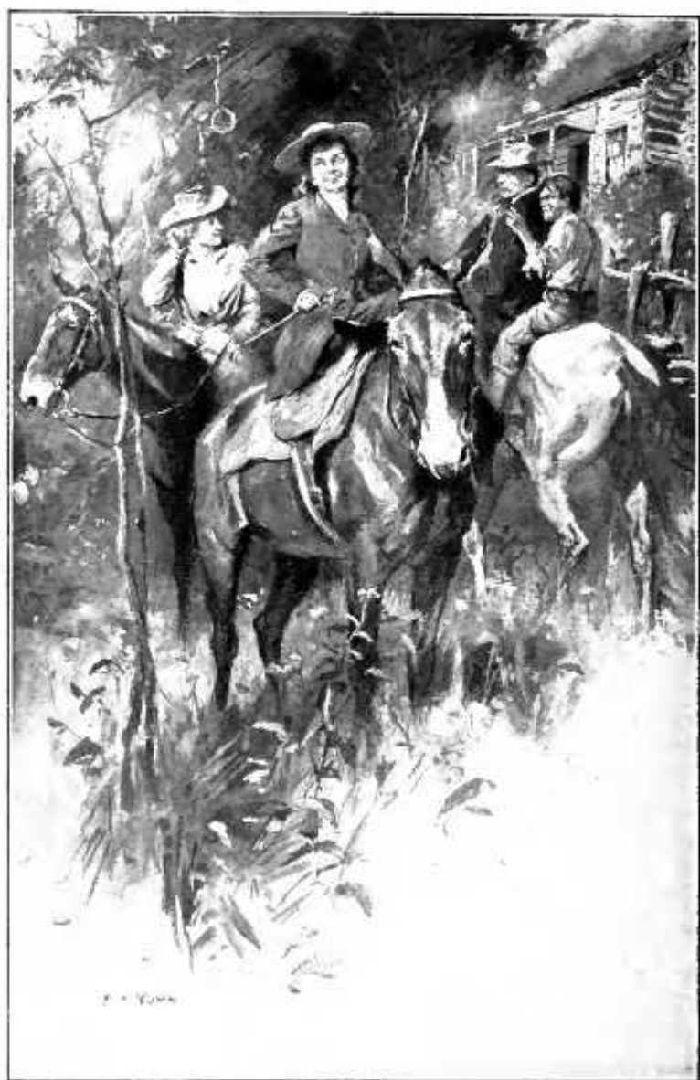
"Mart's a-gittin' ready for a tourneyment."