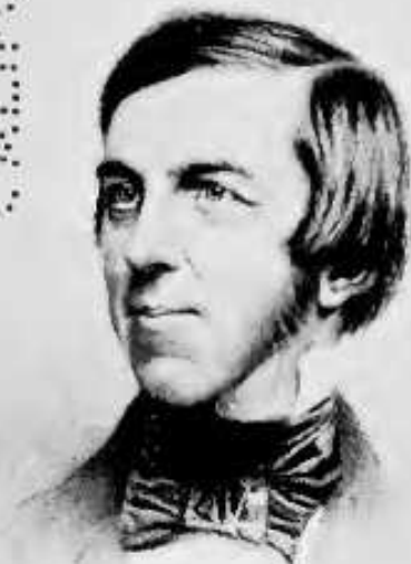
OLIVER WENDELL HOLMES