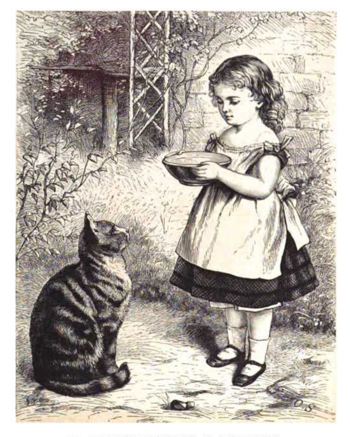
"TO HELP DUMB CREATURES IN THEIR NEED."