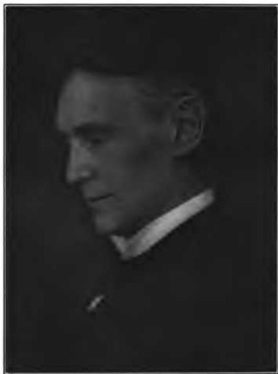
WARD BOND FOOTE