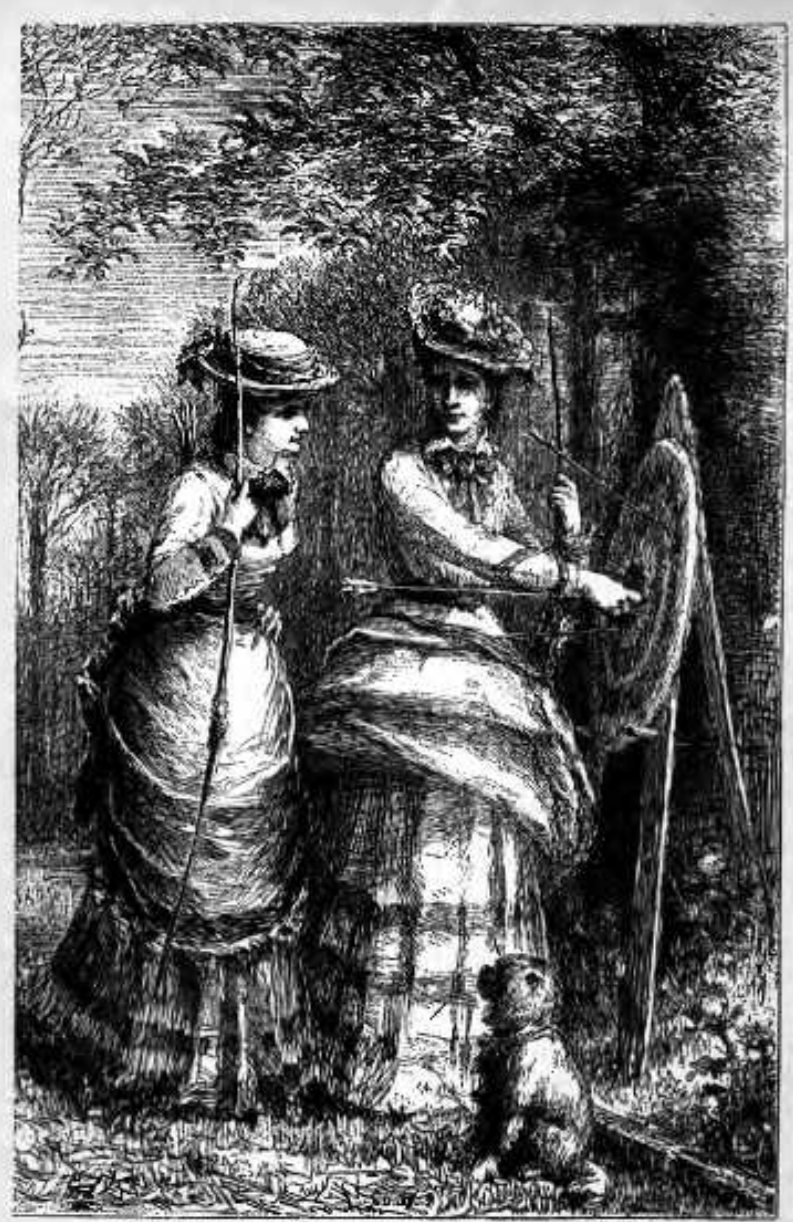
DRAWING THE ARROW (THE STATEN ISLAND CLUB).