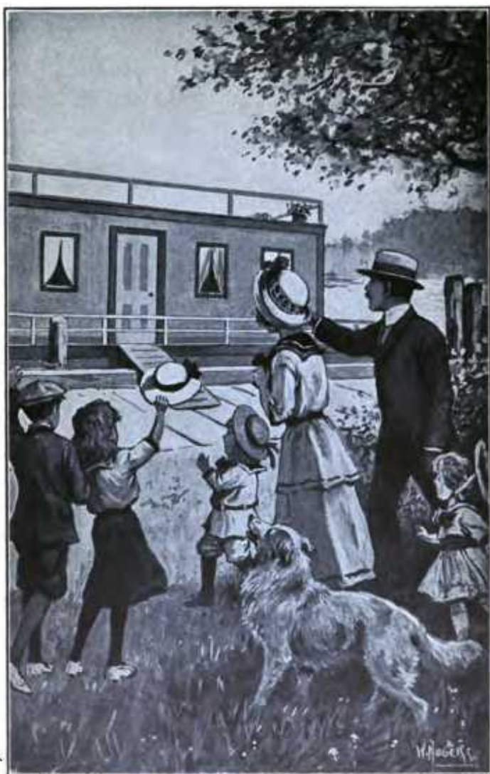
"THE BLUEBIRD" WAS INDEED A FINE, LARGE HOUSEBOAT The Bobbery Twins on a Houseboat. Frontispiece (Page 45)