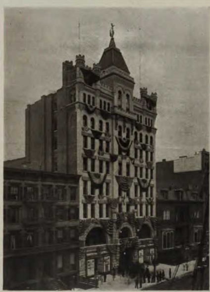
THE NATIONAL HEADQUARTERS OF THE SALVATION ARMY IN AMERICA