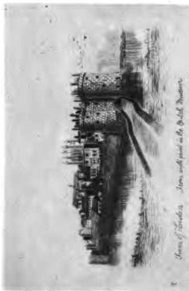
View of the tower from the point in the British Museum