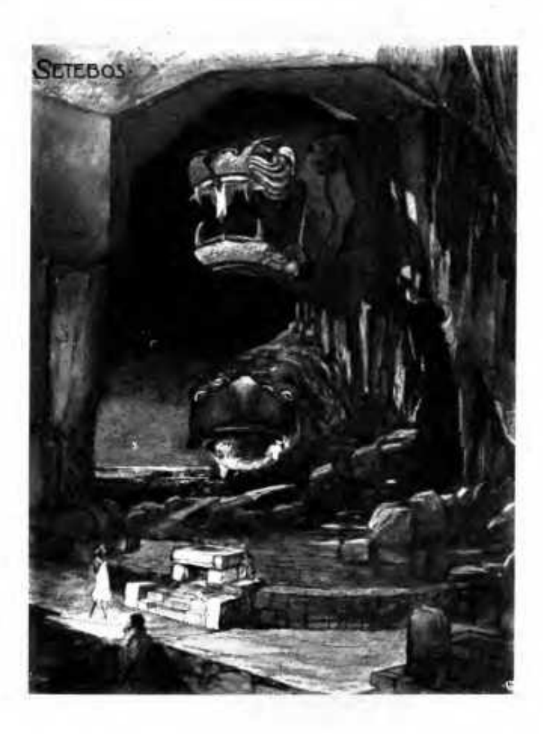
PRELIMINARY SKETCH OF SETEBOS, BY JOSEPH URBAN