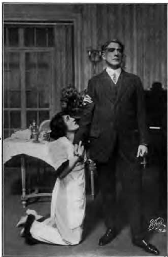
"Forgive me, George," she sobbed, "forgive me."