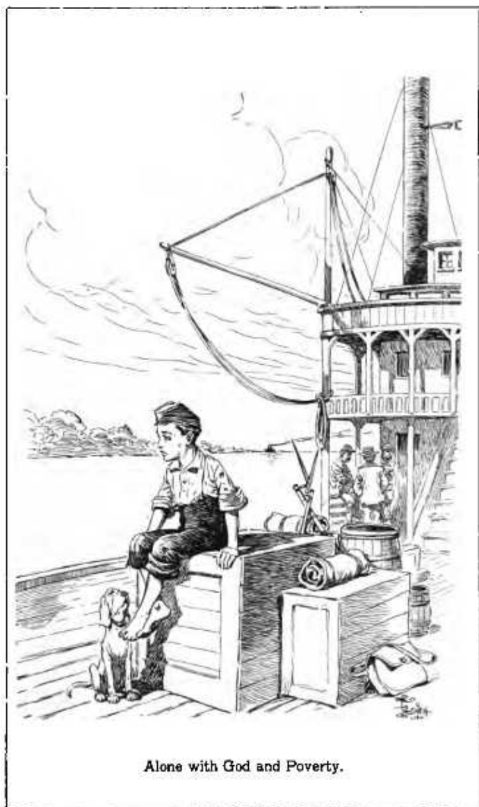
Alone with God and Poverty.