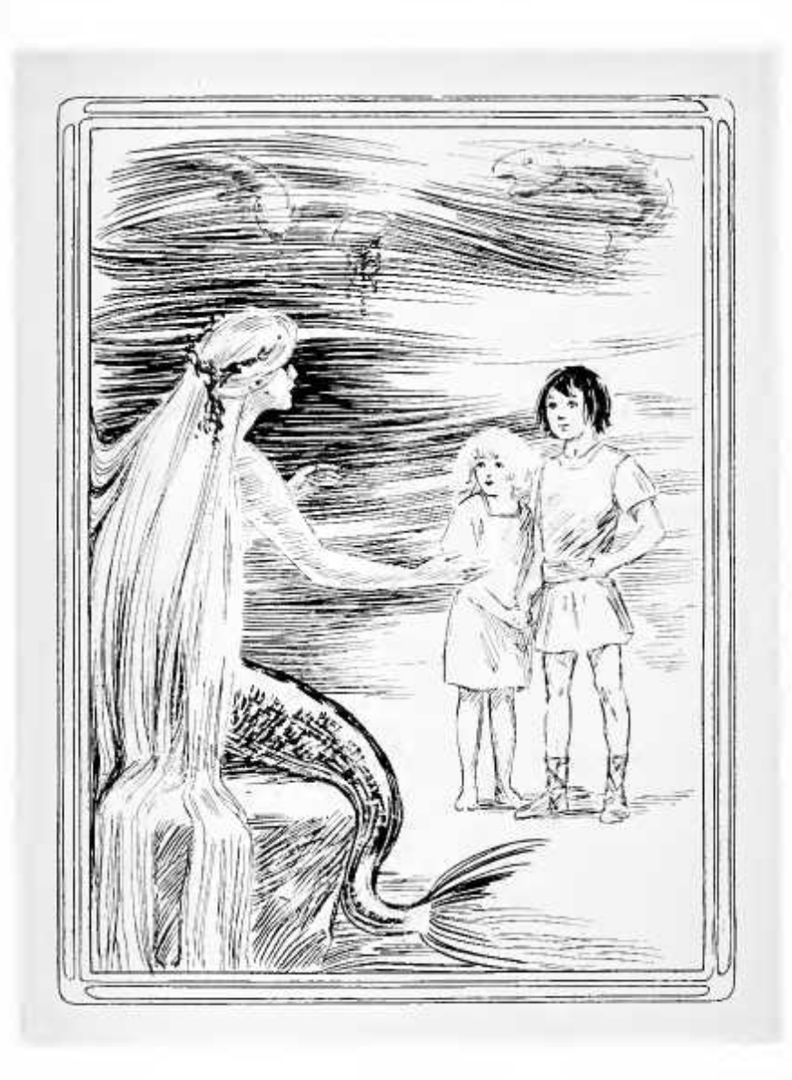
"She beckoned the children to her" . . . . Page 14