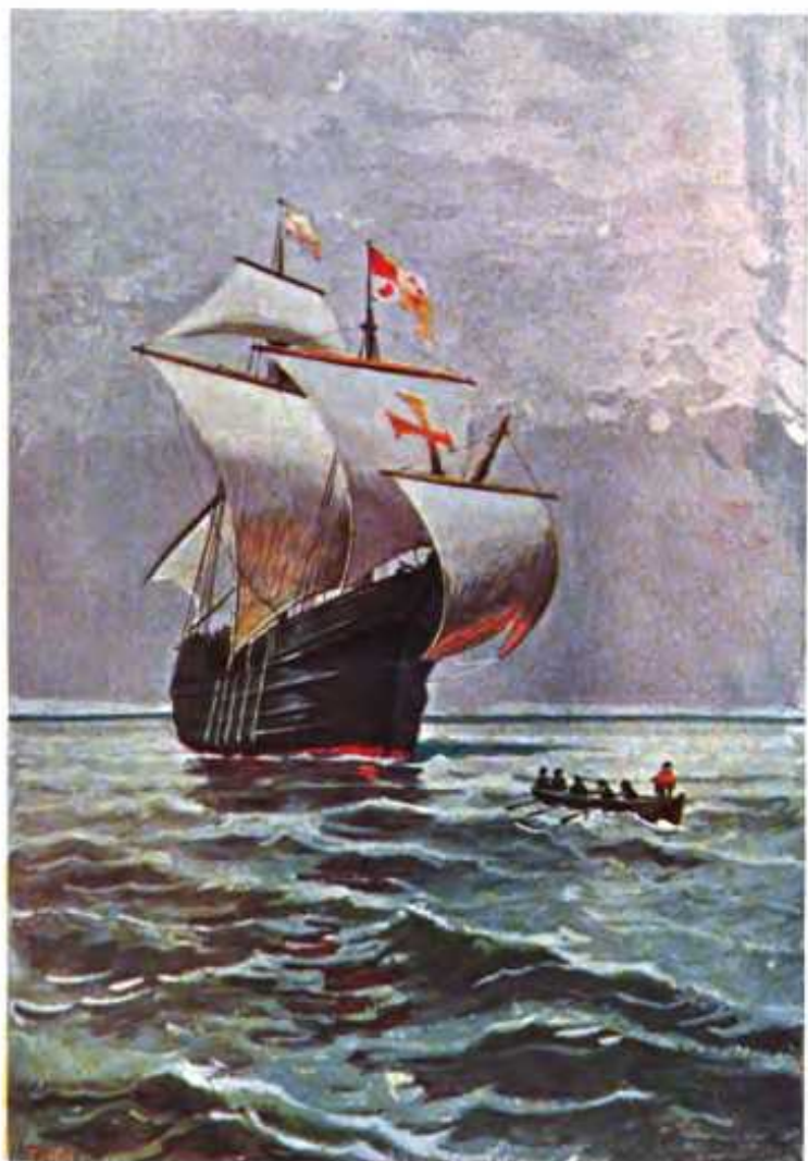
AYALA SENDING BOAT AHEAD IN BAY OF SAN FRANCISCO.