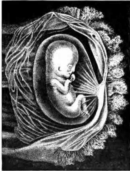
HUMAN EMBRYO, AT THE TWELFTH WEEK, ENCLOSED IN THE AMNION. NATURAL SIZE.