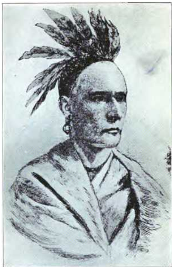
LOGAN, THE MINGO