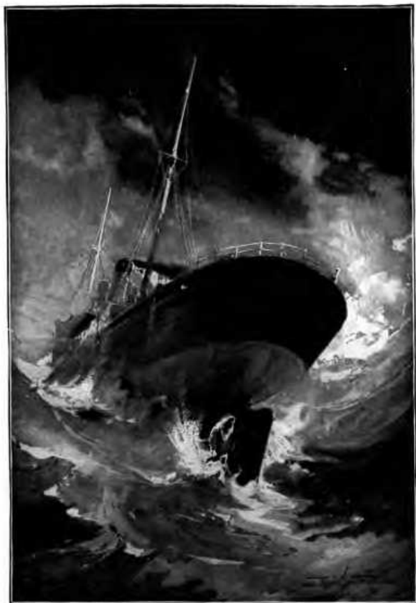
"An unusually severe pitch . . . had lifted the big, throbbing screw nearly to the surface." (See page 173.)