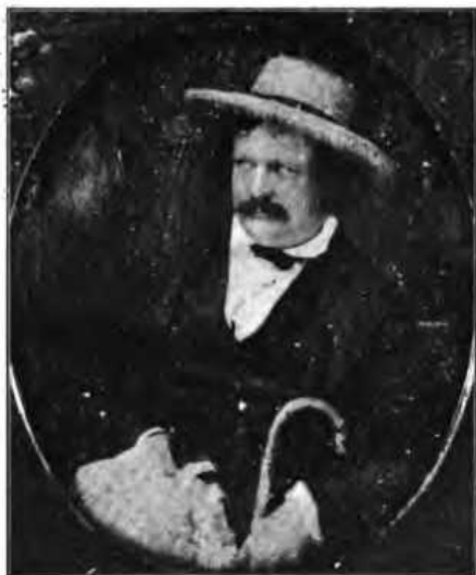
COL. EDWARD Z. C. JUDSON ("NED BUNTLINE")