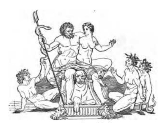
Pluto, Proscrpins, and Furies.