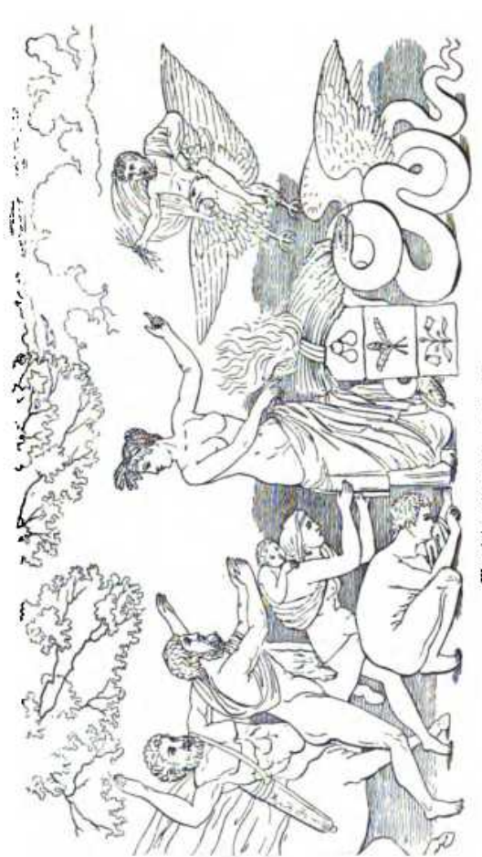
Eleusinian Ceremony.—Denkmiler Sculptur.