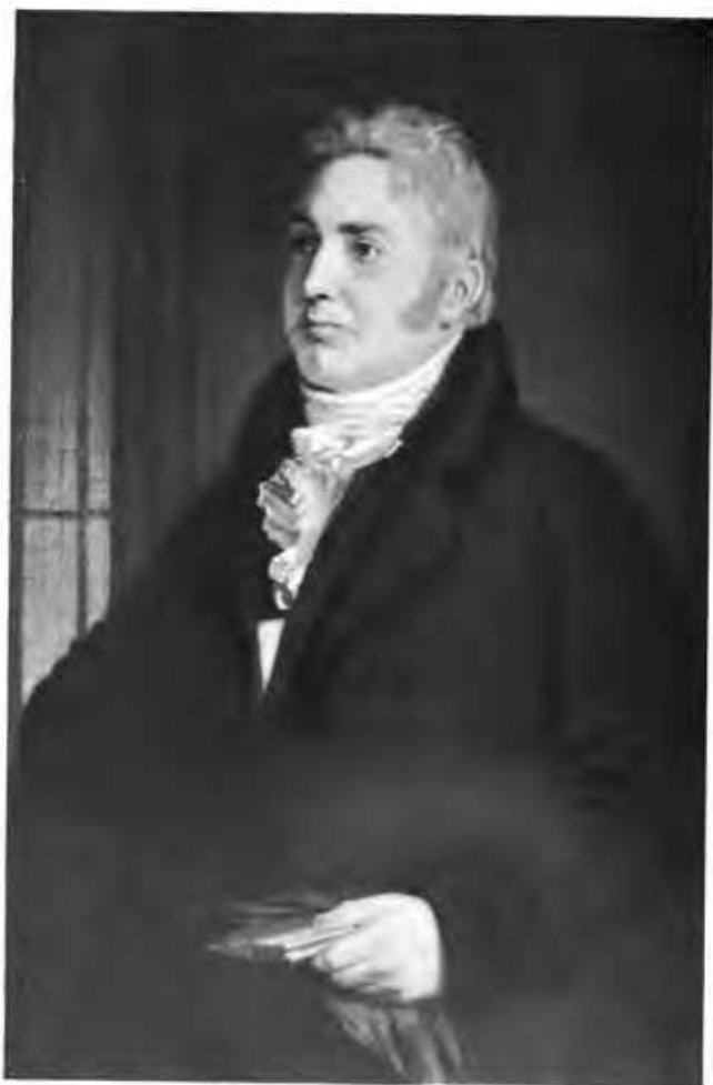
SAMUEL T. COLERIDGE.