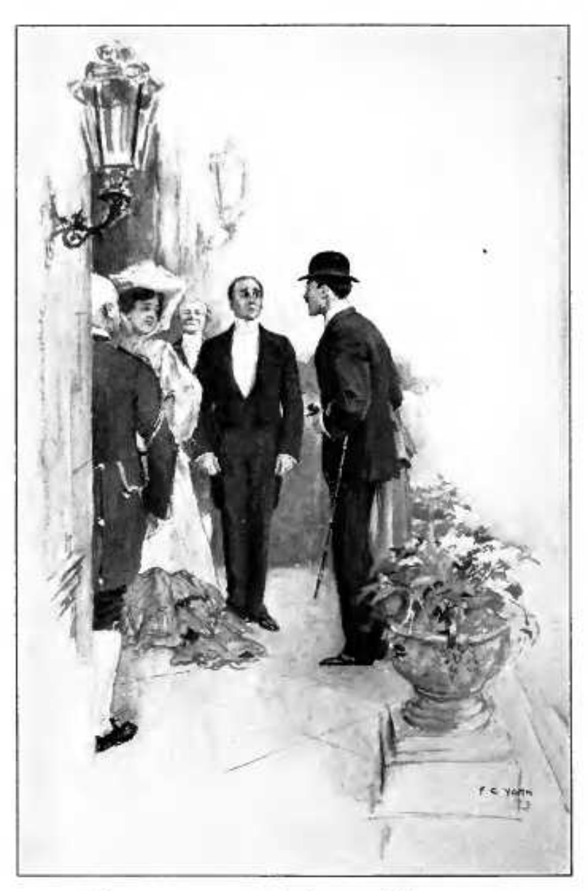
"Have you any frantis for the strains?" he says