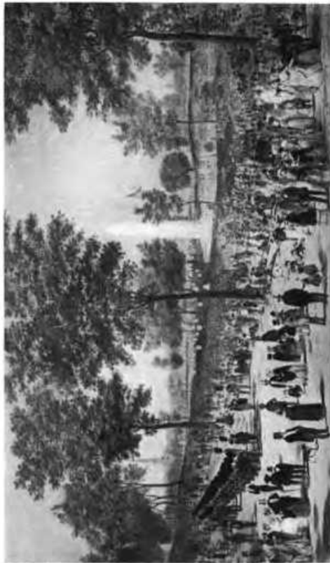
CELEBRATION INCIDENT TO THE INTRODUCTION OF COCHITUATE WATER INTO BOSTON, IN 1848, AND FIRST EXHIBITION PLAY OF THE FOUNTAIN IN THE FROG POND ON THE COMMON. IN LEFT FOREGROUND, WITH A DOG BEHIND HIM, IS DANIEL WEBSTER.