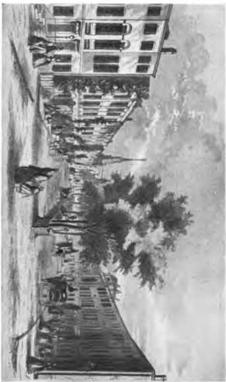
FRANKLIN STREET IN 1855, THEN A FASHIONABLE RESIDENTIAL STREET. AT THE RIGHT IS THE FIRST CONTINUOUS BLOCK OF HOUSES BUILT IN BOSTON. THE DISTANT SPIRE IS THAT OF DR. CHANNING'S CHURCH, SINCE BECOME ARDINGTON STREET CHURCH. IN FRONT OF IT IS THE FIRST EDIFICE OF THE CATHEDRAL OF THE HOLY CROSS. THE URN WITHIN THE ENCLOSURE WAS A MEMORIAL TO BENJAMIN FRANKLIN.