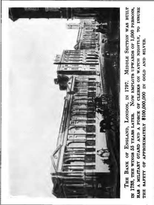
THE BANK OF ENGLAND, LONDON, IN 1797. MIDDLE SECTION WAS BUILT IN 1733, THE WINGS 55 YEARS LATER. NOW EMPLOYS UPWARDS OF 1,000 PERSONS, HAS A MILITARY GUARD AND A FORCE OF CLERKS ON WATCH NIGHTLY, TO INSURE THE SAFETY OF APPROXIMATELY $100,000,000 IN GOLD AND SILVER.