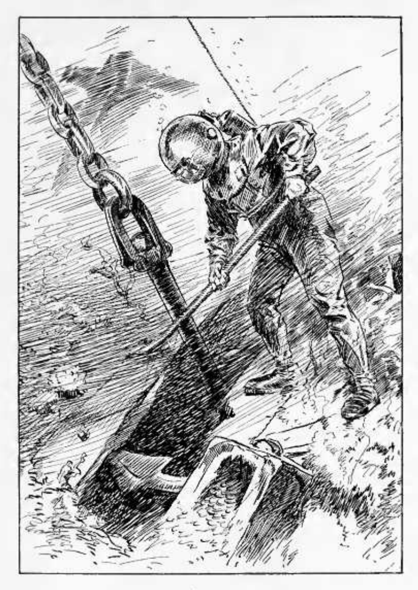
An imperative signal from his communication line. Frontispiece