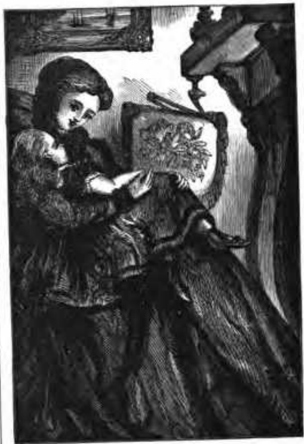
ANNA AND THE COUNTESS.