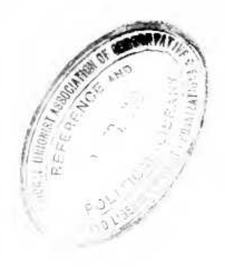
First published in 1916